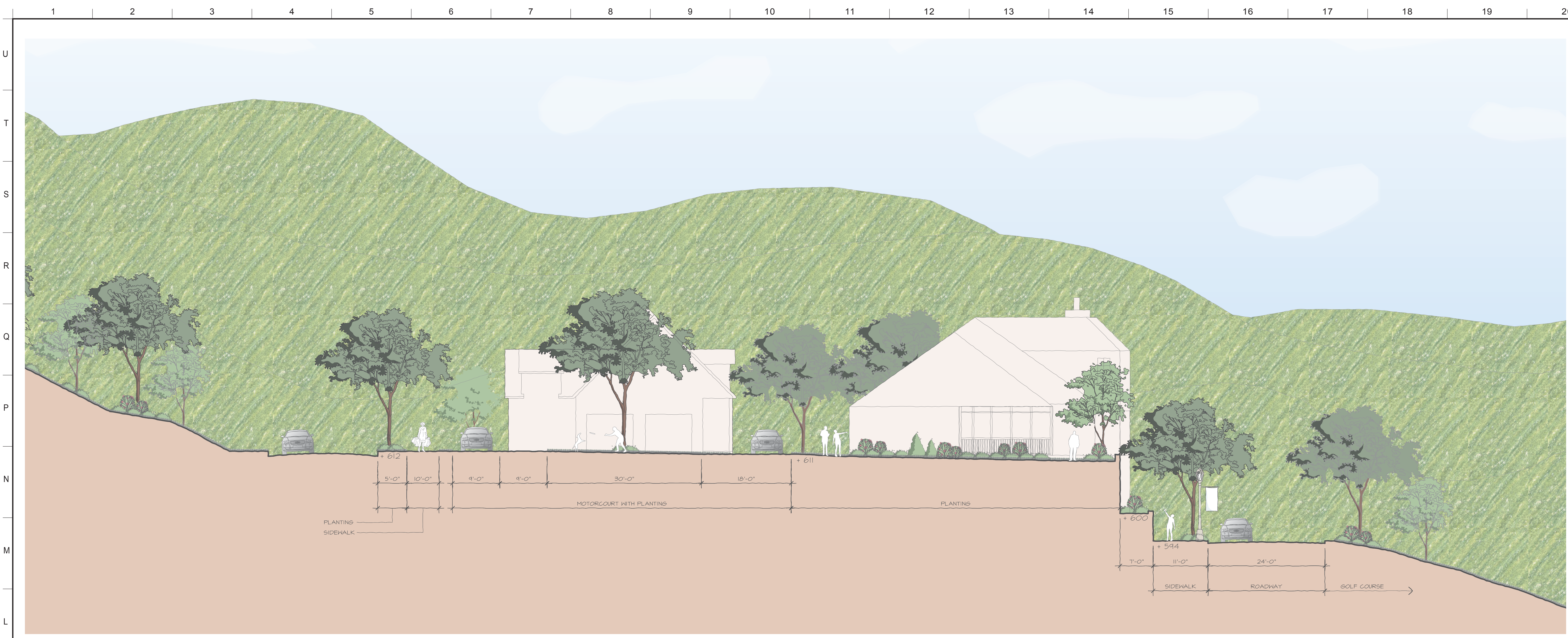
K1 SECTION THROUGH GOLF VILLAS SCALE: 1/8" = 1'-0"